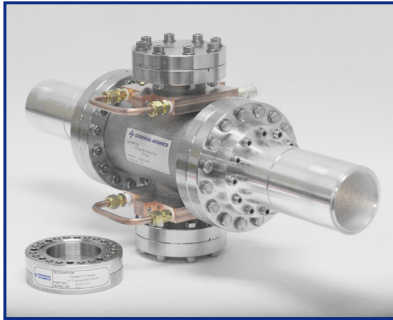
2.5" Gap-type pumpout