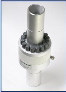
2.5" DC break