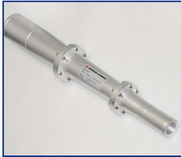
2.5" to 1.25" HE_{11} taper